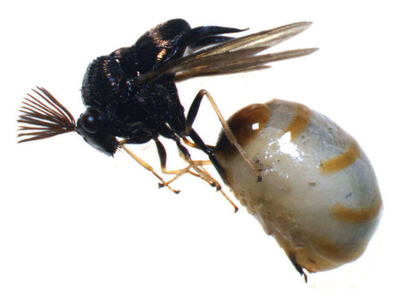
Figure 1. Adult male specimen of Kapala sp.

deposited at the University of California Riverside Entomology Research Museum, USA. The host colony of D. lucida was collected in the fields of the Barrolândia station of CEPLAC in Belmonte, state of Bahia, Brazil (47°73'02"S, 82°21'24"W). The pupa was dissected and the cerebral ganglia were used for obtaining mitotic metaphases according to Imai et al. (1988). Metaphases were stained using Giemsa stain (1:30) and analyzed with an Olympus BX60 microscope equipped with a digital camera. The adult specimen and pupa were studied and photographed with an Olympus SZX7 stereomicroscope. The photographs of the collected insect specimens and metaphases were taken using the Image Pro Plus<sup>®</sup> version 4.1 analysis software (Media Cybernetics). Karyotypes were digitally mounted and the chromosomes were grouped according to Levan et al. (1964).