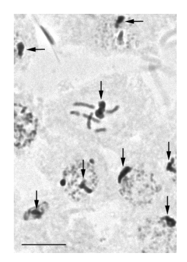
Figure 3. Heterochromatinization of paternal haploid set of chromosomes in the male embryonal cells of Nipaeococcus delassusi (Balachowsky, 1925) (Coccinea: Pseudococcidae), K 1276, Morocco (vicinity of Tangier); 2n = 12, heterochromatinized chromosomal sets are arrowed. Scale bar: 10 μm.

unique morpho-anatomical and physiological peculiarities, which are unknown in any other animal group. Several characters in scale insects lead to external similarity in related, but clearly not sister groups of insects. Thus, a very unusual "dizygotic development", which is similar in general appearance to the double fertilization of the flowering plants, is known for the members of the most archaic family of neococcids, Pseudococcidae, and also in the most evolutionary advanced family Diaspididae, but unknown in all other scale insect families. The presence of a paired symmetrical bacteriome is characteristic for some archaeococcids and for whiteflies (Aleyrodinea), whereas unpaired bacteriomes are characteristic for neococcids, aphids and psyllids (Buchner 1965). Most representatives of the family Pseudococcidae have so-called ostioles (one or two pairs of symmetrical openings on anterior and posterior segments of dorsum), which are probably homologous to siphunculi of aphids; the ventral abominal openings of some Pseudoccoidae (circuli) are probably homologous to marsupial opening in representatives of some genera of the archaeococcid family Margarodidae s.l. The cerarii, symmetrical groups of conical setae and wax glands along body margin of many Pseudococcidae, are clearly homologous with marginal tubercles of aphids, etc.