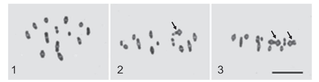
Figures 1–3. Male meiosis in C. ledi. I Metaphase I with normal karyotype, n = 12 + X (0) (from Kuznetsova et al. 1997) 2 Metaphase I. Arrow points to trivalent which is heterozygous for a fusion 3 Metaphase I. Arrows point to two trivalents which are heterozygous for fusions. Scale bar: 10 µm.

The chromosome number of females is most easily determined at metaphase I in mature eggs. For a closer study of the biology of females during one season, several samples were taken from the Turku population in 2010 starting on 30.6., when adults just appeared in the population (Table 1). First females with mature eggs were found not earlier than 11.8, when single mature eggs were found in very few females (Table 2). On 25.8.2015 all females carried several mature eggs in their ovaries. The egg-lying of females was studied in the laboratory using material collected in 2015. We found that