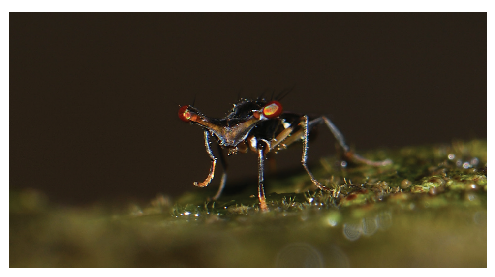
Figure 1. Stalk-eyed flies Sphyracephala detrahens.