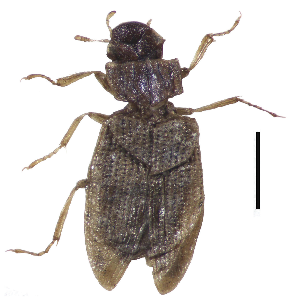
Figure 3. Fossil H. orientalis from Starunia. Scale bar: 1 mm.

important here is that the regional variation found in H. brevipalpis allows the possibility that the triploids may have resulted from crossing between genetically differing stocks.