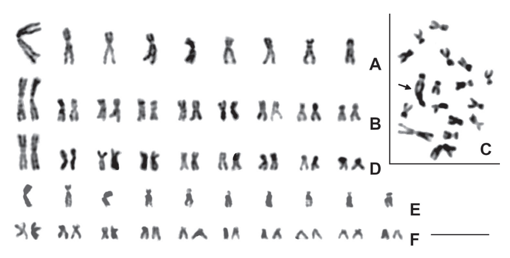
Figure I. Mitotic chromosomes of Aylacini. Isocolus scabiosae A haploid karyogram B diploid karyogram C diploid metaphase plate with dicentric chromosome (indicated by arrow); I. jaceae D diploid karyogram; Aulacidea hieracii E haploid karyogram F diploid karyogram. Scale bar: 10 μm.