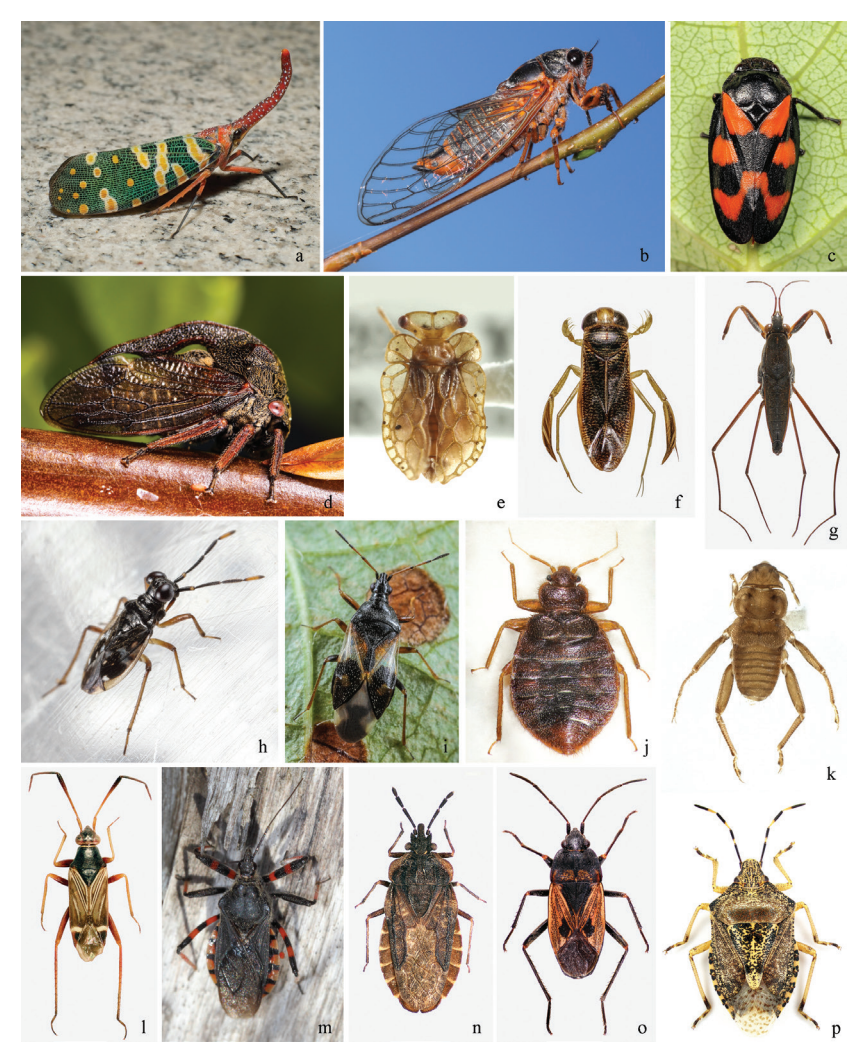
Figure 2. a-p Species from main taxonomic groups of Paraneoptera insects (continuation) a Pyrops candelaria (Linnaeus, 1758) (Cicadinea, Fulgoridae), photo and "Creative Commons" license of "Sterling Sheehy" (see Acknowledgements) b Cicadetta montana (Scopoli, 1772) (Cicadinea, Cicadidae), photo of E.Yu. Kirtsideli, PhD c Cercopis vulnerata Rossi, 1807 (Cicadinea, Cercopidae), photo of E.Yu. Kirtsideli, PhD d Centrotus cornutus (Linnaeus, 1758) (Cicadinea, Membracidae), photo of E.Yu. Kirtsideli, PhD e Pantinia darwini China 1962 (Coleorrhyncha, Peloridiidae), photo and "Creative Commons" license of "Sterling Sheehy" (see Acknowledgements) f Glaenocorisa propinqua (Fieber, 1860) (Heteroptera, Corixidae), photo of D.A. Gapon g Gerris sphagnetorum Gaunitz, 1947 (Heteroptera, Gerridae) h Chartoscirta elegantula (Fallén, 1807) (Heteroptera, Saldidae), photo of E.Yu. Kirtsideli, PhD i Anthocoris nemorum (Linnaeus, 1761) (Heteroptera, Anthocoridae), photo of E.Yu. Kirtsideli, PhD j Cimex hemipterus (Fabricius, 1803) (Heteroptera, Cimicidae), photo of D.A. Gapon k Hesperoctenes fumarius (Westwood, 1874) (Heteroptera, Polyctenidae), photo and "Creative Commons" license of "CBG Photography Group" (see Acknowledgements) I Cremnocephalus albolineatus Reuter, 1875 (Heteroptera, Miridae), photo of D.A. Gapon m Rhynocoris annulatus (Linnaeus, 1758) (Heteroptera, Reduviidae), photo of E.Yu. Kirtsideli, PhD n Aradus laeviusculus Reuter, 1875 (Heteroptera, Aradidae), photo of D.A. Gapon o Rhyparochromus phoeniceus (Rossi, 1794) (Heteroptera, Lygaeidae), photo of D.A. Gapon p Rhaphigaster nebulosa (Poda, 1761) (Heteroptera, Pentatomidae), photo of D.A. Gapon.